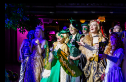
Page 10 Year: 2026 Title: "Wizard Act" (audience reaction) Event: Revelry Ball