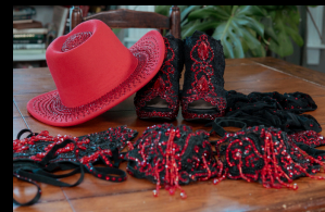
Page 6 Year: 2026 Title: "Serotonin Devil Costume"