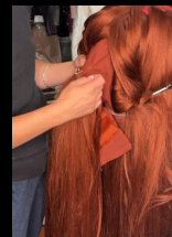
Page 6 Year: 2025 Title: Building the Hair Jackey