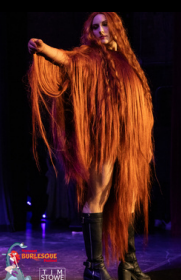
Page 4 Model: Anita Tension Year: 2026 Title: "Hairy Creep Act" Event: VT Burlesque Festival