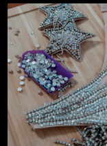
Page 6 Year: 2025 Title: Building the Hair Jacket