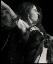
Page 2 Model: Anita Tension Year: 2026 Title: "Hairy Creep Act" Event: VT Burlesque Festival