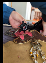
Page 6 Year: 2026 Title: Building the Leather Chaps